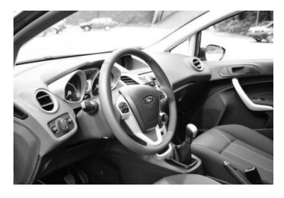
Figure 5: "Cheaper, practical materials"

Mass customization, i.e., catering to consumers' needs, can be used as a way to achieve the cost-effective goal of purchasing. More specifically, the ability of consumers to choose which design elements should be implemented for targeted products without spending money for