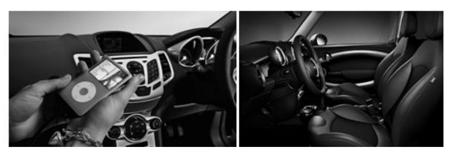
Figure 6: "Customized for the needs of the E Generation"

unnecessary features could be an invaluable marketing tool. In fact, the current study, showing the preference for "customization for consumers' needs" indicates that the functionality and usability of crossover B-car interiors reflect not only consumers' preferences but also their motive to save money. "Customized for consumers' needs" can be further broken down into two aspects: the first aspect is "customization for the needs of a specific population", meaning that interior equipment should be designed according to a specific populations' needs. Thus, specific items include designs for the E Generation (Figure 6), females, housewives, passengers, singles, and designs for consumers that show a preference for sport or recreation vehicles. The second "customized for consumers' needs aspect is "customization for individual preference". Therefore, specific design aspects should include customization of interior style, interior equipment, the disposition of the central unit, and the selection of storage. In addition, optional decorative accessories and seating styles of should also be included.