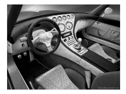
Figure 3: "Changeable interior style"

As shown in the category scores in Table 3, "changeable interior style" (See Figure 3) had a stronger effect on "design for enthusiasts of sport or recreation" than the others. In addition, "design for singles" had a stronger negative effect on this factor than the others did.