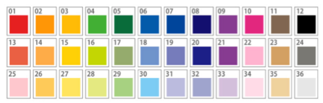
Figure.1 color chart

hue balance. Participants were interviewed about their favorite colors and their specific color preference for each product category