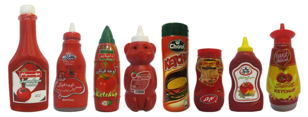
Figure 2: Eight sauce ketchup bottle samples used in the Kansei experiment after selection