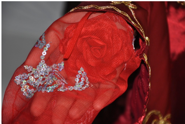
Figure 3: The future bride's henna hand