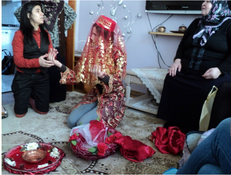
Figure 2: Henna try-out