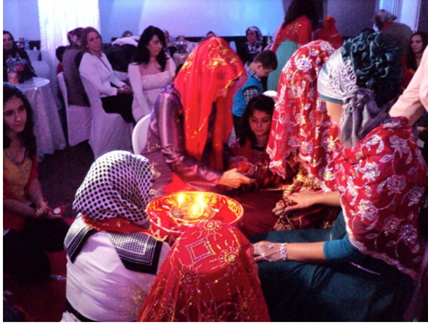
Figure 1: Performance of henna ritual in Brussels

Within the lifecycle rituals, marriage - according to Van Gennep- constitutes the most important of the transitions from one social category to another, and for at least one of the spouses it involves an economic, (Van Gennep, 1977: 119) territorial (Van Gennep, 1977: 192) and essentially a social act. (Van Gennep, 1977: 117)