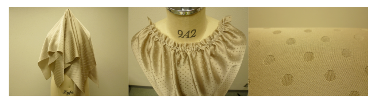
Fig. 1 shows examples of textile images.

(8) Movie of textile movement when it is balled up by hand and then expands. The dimension of the textile is 20cm by 20cm