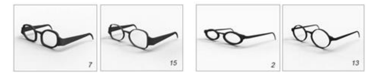
Figure 5: Extreme samples of European group

For European participants, the Kansei pair "obedient-rebellious" is the least understood, while the Kansei pair "smart - ordinary" is the most unified. According to the CV values, the extreme samples of European group are introduced in Figure 5. Europeans have identical ideas towards eyeglass frame samples P07 and P15, which have big rim with wide frame leg, considered as neutral, special, original and funny design. The eyeglass frame samples P02 and P13 (round rim profile with narrow frame leg) are most controversial, typically "feminine-masculine" for P02 and "obedient-rebellious" for P13. Although Experiment 1 verified that rounded shape was perceived as beautiful, simple, reliable and comfortable for both western and eastern people, the sophisticated of designed product (multifactor with interactions) are much more difficult to understand. The change of a single factor even evoke opposite view.