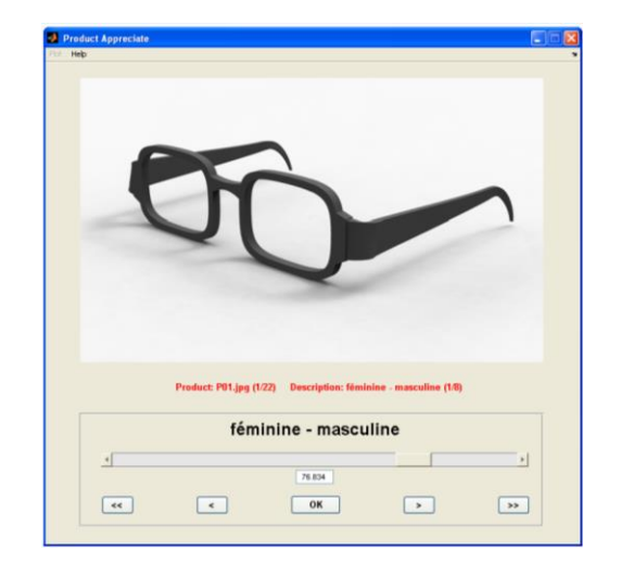
Figure 3: Interface of the Experiment 2

Latin Square in order to control the order and carry-over effects. The experiment was fully balanced because had 22 products and 88 subjects. In order to make the task of the test as user-friendly as possible, Matlab graphical interface was designed, shown in Figure 3.